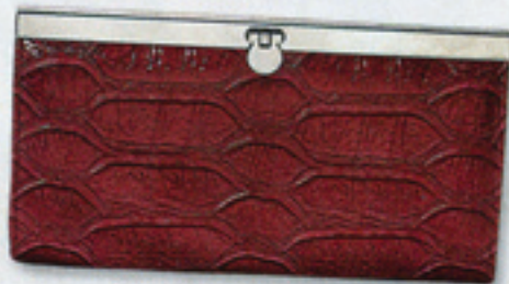
Narmi accordion wallet, $25, timeworldusa.com