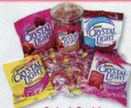
Sorbee's Crystal Light Sugar-Free Hard Candy, $400 value (one-year supply), sorbee.com

NO PURCHASE NECESSARY. Open to current legal residents — age 13 and older — of the United States and the District of Columbia. Void elsewhere and where prohibited or restricted. For full rules and free entry, go to LSwinit.com .