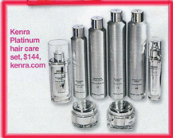
Kenra Platinum hair care set, $144, kenra.com