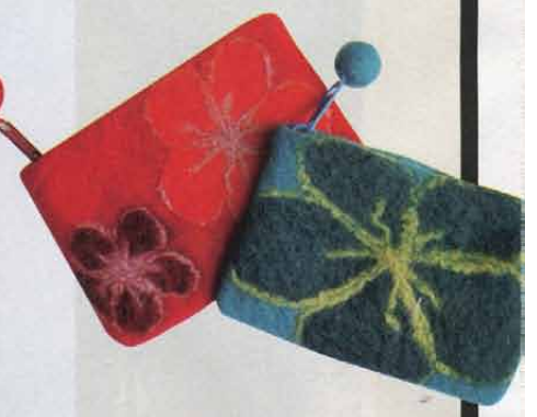
Felt coin purses, $10.99 each

Go ahead, hit the snooze button. For those mornings when an extra 10 minutes of sleep trumps hopping into the shower, Indy-based Kenra has created a dry shampoo that blows some Heidi Klum-grade fluff into your hair without the chalky after-effect left by lesser brands. The spray also doubles as a styling product, with an added bonus: cutting back on your wash-'n'-dry regimen extends the life of your color and blowouts. Find it at Trade Secret, Beauty Brands, and Ulta stores. —JENNIFER UHL