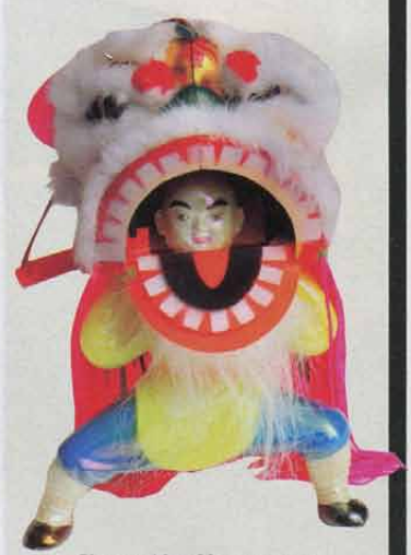
Chinese New Year toy, $10