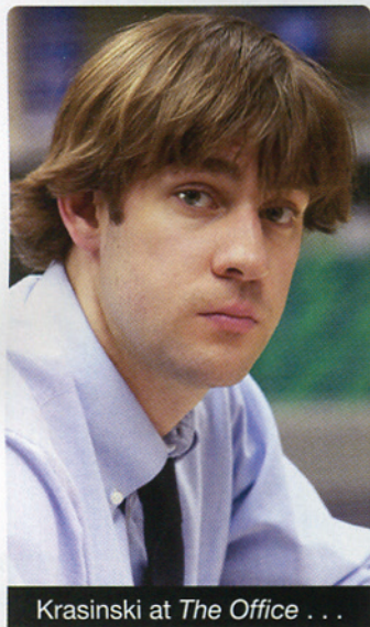
Krasinski at The Office . . .