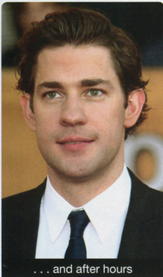
. . . and after hours